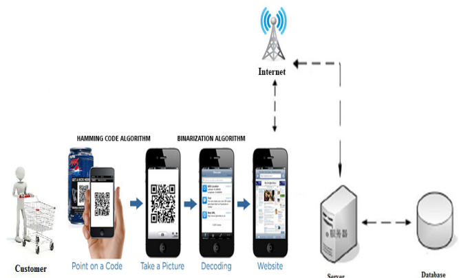
Figure 1. System Architecture

Android applications keep running during a sandbox, a confined territory of the framework that doesn't have admittance to no matter remains of the framework's assets, unless access authorizations square measure expressly conceded by the shopper once the appliance is introduced. Before introducing associate application, the Play Store shows each single needed consent: a diversion might have to empower vibration or spare info to a South Dakota card, as an example, however won't need to see SMS messages or get to the phone book. within the wake of exploring