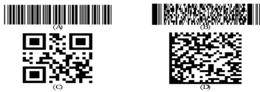
Fig. : Examples Of Commonly Used Barcodes. (a) Code 39, (b) PDF 417, (c) QR code, (d) Data matrix code.

Notwithstanding the employment of scanner tags, info storage away is Associate in Nursing choice signal-rich-workmanship correspondence methodology that inserts info into unfold media for applications like secret correspondence, copyright insurance, verification, so forth. With the event of laptop innovation, various info concealing techniques are connected on computerised unfold media, as an example, pictures, recordings, sounds, content reports, so forth [11-16]. In any case, this info concealing techniques exchange info by suggests that of advanced records because it was. Moreover, they're for the foremost half lacking to empower the sign rich-craftsmanship impact once one has to connect with the encircling atmosphere. Such methods can be known as "advanced" info storage away.