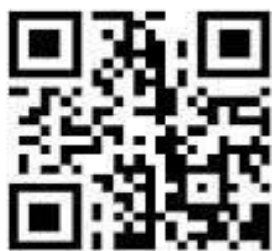
Figure 2. Generating QR code

In this module square measure creatingqr codes for coding the data concerning the merchandise.The product contains name, code, amount and worth. every pattern is encoded and diagrammatical every module in qr code with black and white special symbols. Qrcode will hold info over alternative bar codes. The format of QR Code includes distinctive Finder Pattern (Position Detection Patterns) situated at 3 corners of the image and may be accustomed find the positioning of the image, size and inclination.